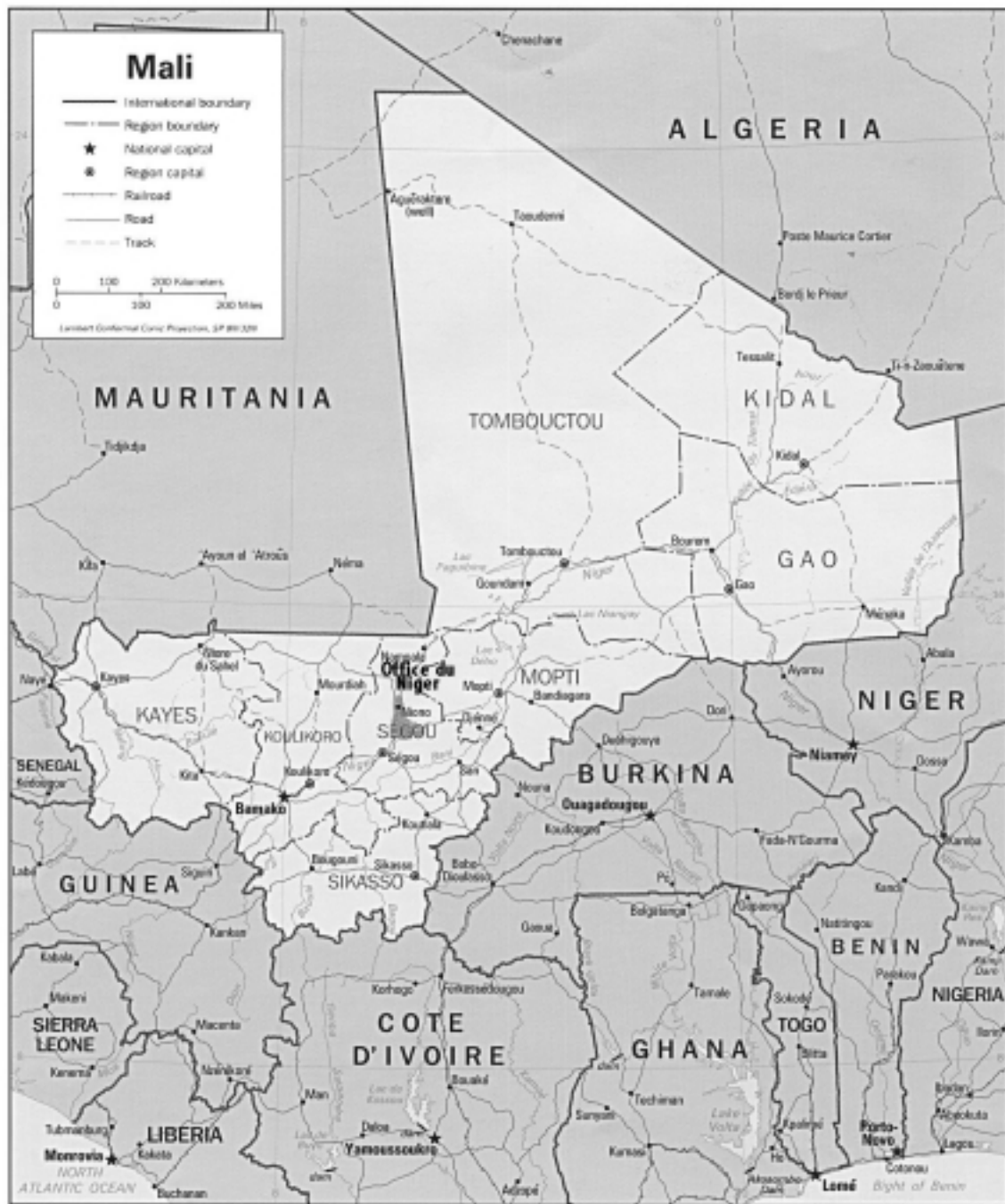
Figure 1. Map of Mali